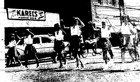
YOUNGSTERS IN THE SUMMER recreation program paraded through Main street Thursday...